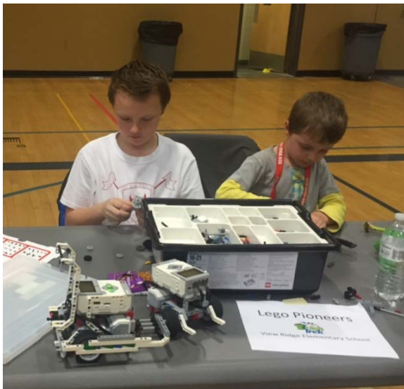
Two team members from View Ridge Elementary school focusing on their project