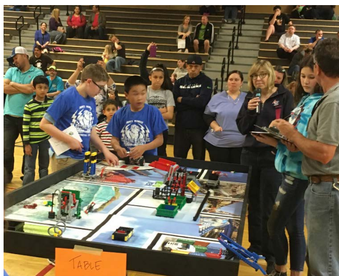
Monroe Elementary School's team powers up their robot

The Eisenhower event is the second district competition held this year, following the March district competition at North Middle School. Next year's First Lego League season will begin in September.