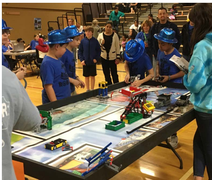
Mill Creek Elementary School's team demonstrating their robot for judges

FIRST Robotics district competition caps a successful year of robotics in schools